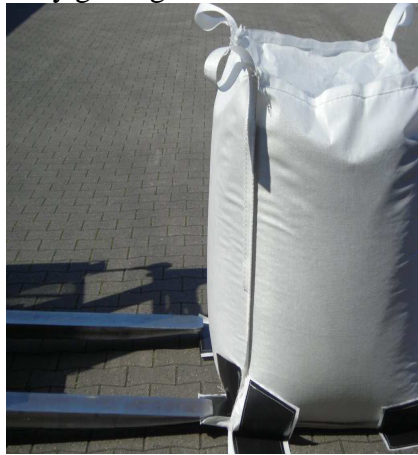
Easy gliding sleeves