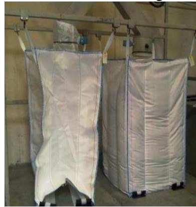
Perfect performance even in case of automatic filling