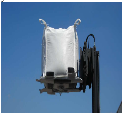
2-way or 4-way, the choice is yours!